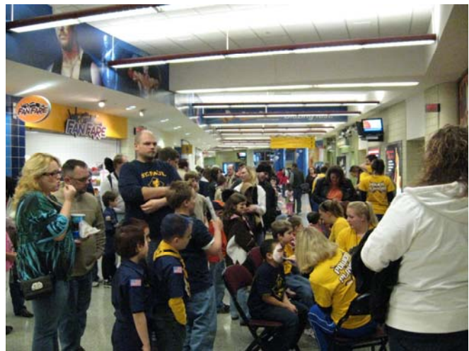
The line for face painting at the Day at the "Q".